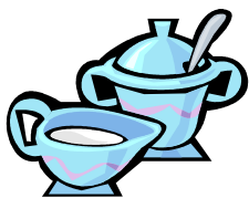
sugar and cream